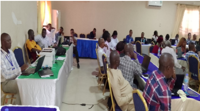
Participants of the Retreat

The retreat's main objective is to address the gaps in the learning management system by supporting Higher Educational Institutions (HEIs) to upload relevant data and ensure accessibility to academic records. This would eventually help in the implementation of the Students' Loan Scheme, service delivery, quality assurance and management of staff.