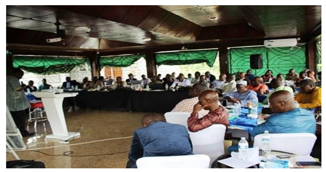
Stock taking retreat session

Major public education stakeholders in Sierra Leone converged in the eastern city of Kenema on the 4th and 5th of July 2019 to identify and discuss progress and challenges faced by public tertiary institutions over the last one year.