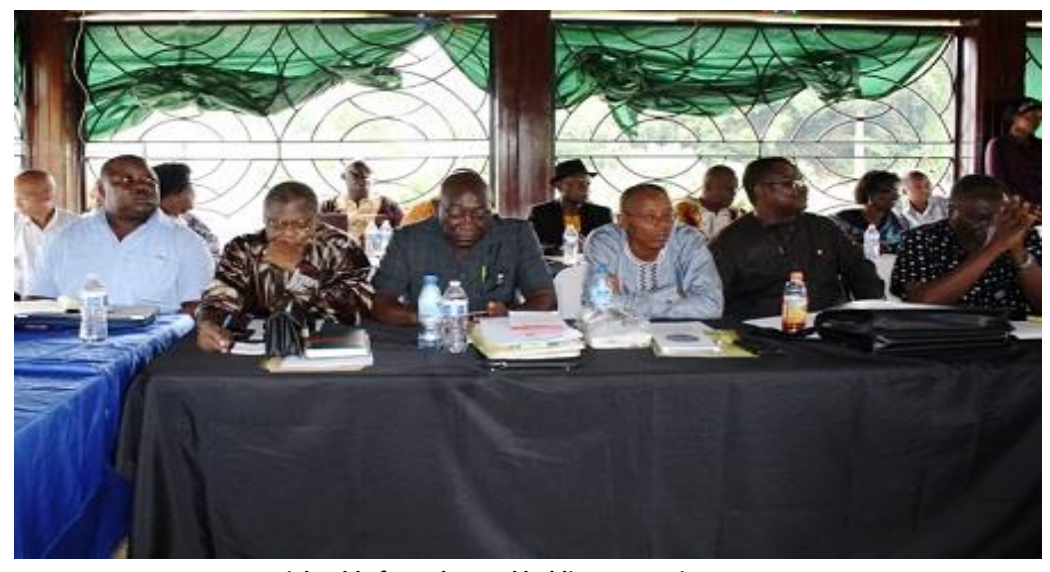
High table from the stockholding retreat in Kenema

At the stocktaking retreat organised by the one year old Ministry of Technical and Higher Education (MTHE), various universities, colleges and polytechnics made presentations bordering on the status of their institutions in line with an eighteen-point terms of reference given to them by the ministry.