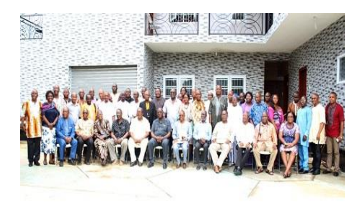
Cross section of public education stakeholders at the end of program