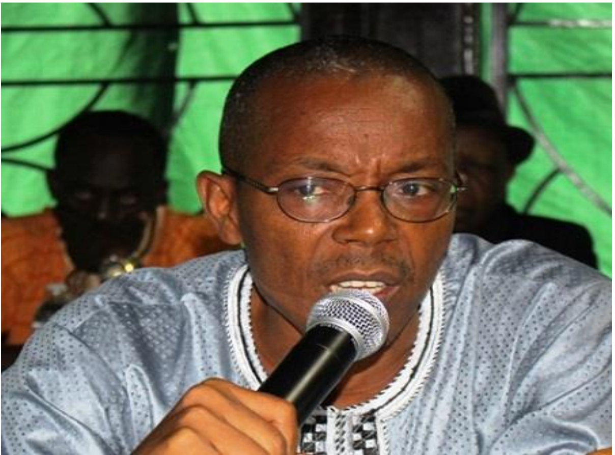
The Deputy Minister of Technical and Higher Education, Dr. Turad Senesie

The Deputy Minister of Technical and Higher Education, Dr. Turad Senesie disclosed that the rationale for the retreat was to review progress, identify gaps, and map out the way forward for the various institutions.